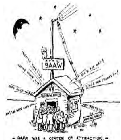
QST, November 1923, p. 17.

DA FINE PRINT: The W3UU Newsletter of the Harrisburg Radio Amateurs Club Inc. (HRAC) is published monthly and is © 2023: All Rights Reserved. Every effort is made to ensure that the newsletter is free from error or omissions. The HRAC, its respective Officers or agents, shall not accept responsibility for offenses (e.g. injury, loss, or damage) occasioned to any person acting or refraining from action as a result of material in this newsletter, whether the offenses in any way are due to any negligent act or omission, breach of duty or default on the part of the HRAC, or representative agents.