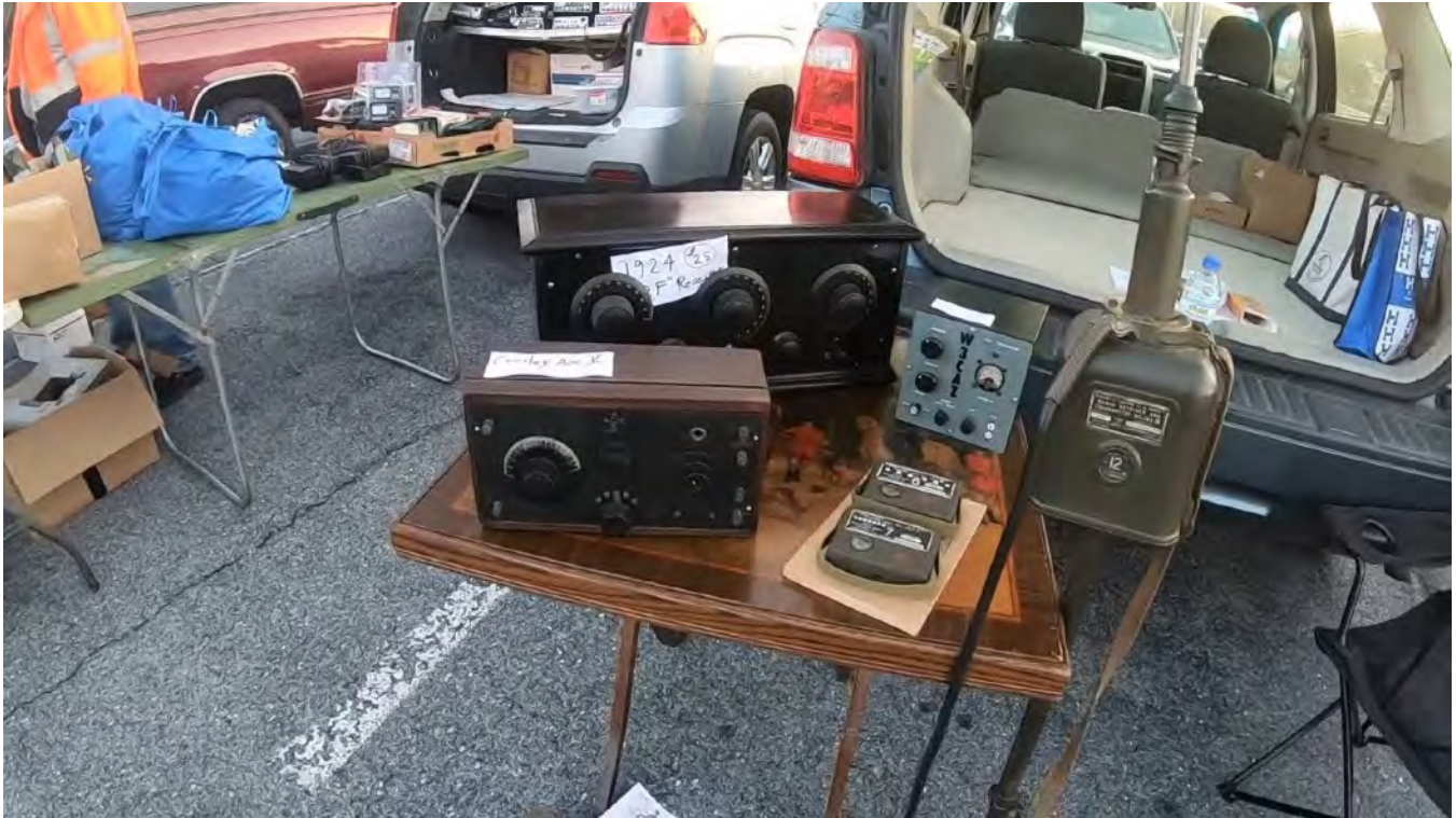
Thanks to: Hamfest PA, https://youtu.be/50KRtl2kqIY?si=SJINUMapGllndopE [click on photo to open in your browser for the video]