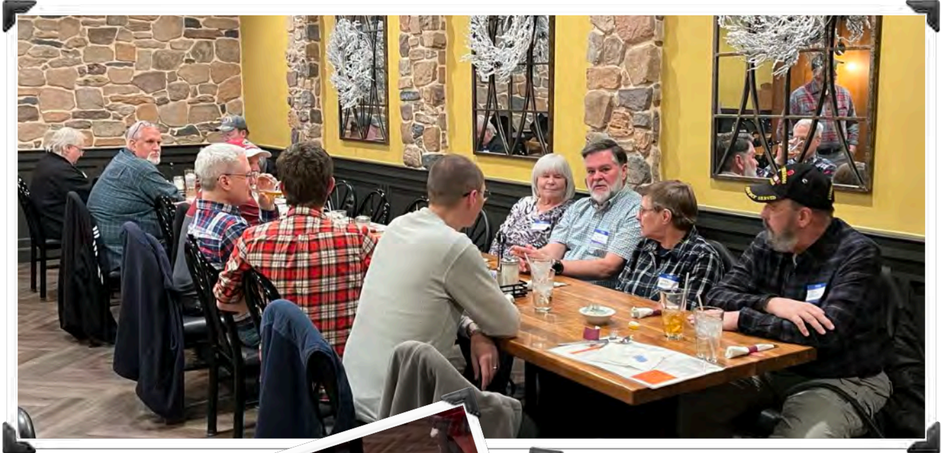
A few of the attendees.