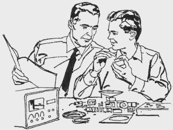
What is an Elmer?