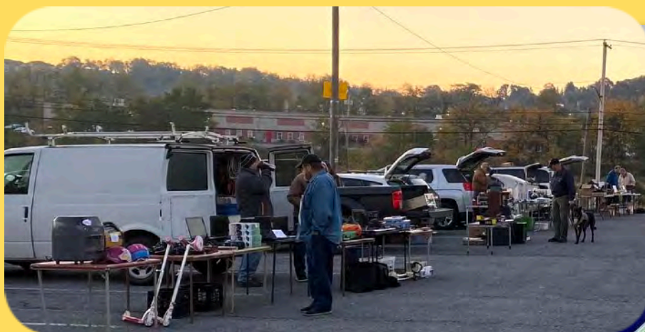
Two of the concession volunteers of the Vietnam Veterans Local 542 , Harrisburg.