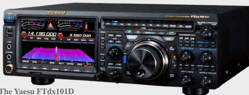
The Yaesu FTdx101D