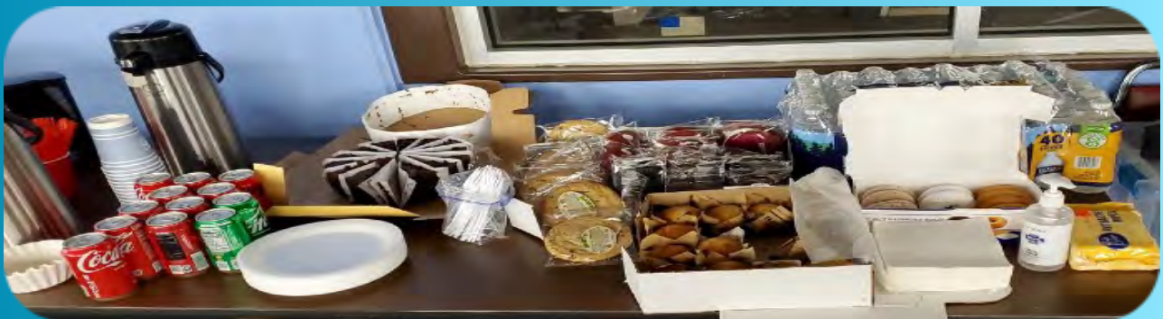
Refreshment exceeded expectations. Homemade muffins by KZ3KBD. — KC3MG