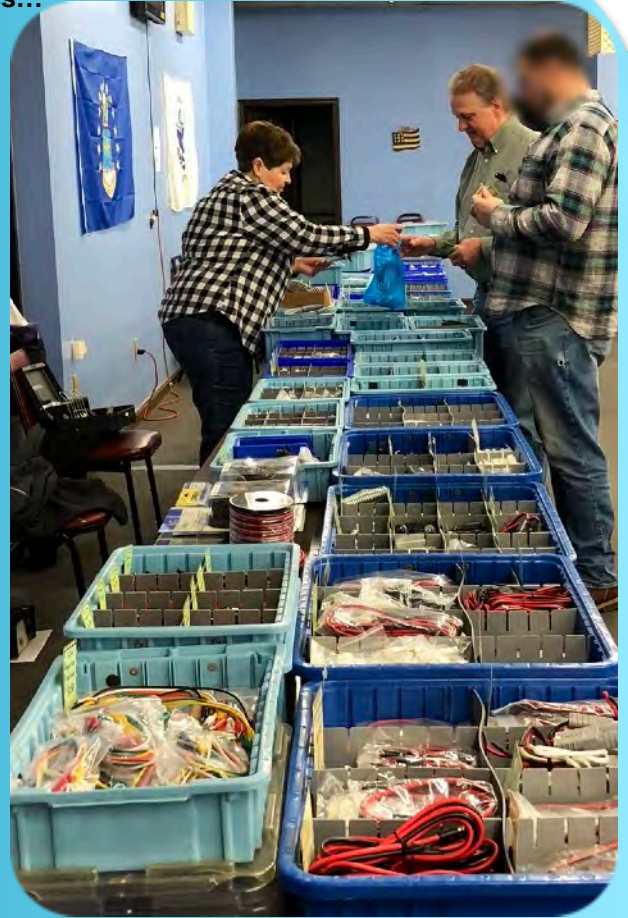
Satisfied customers at Sauder Electronics. — K3URT