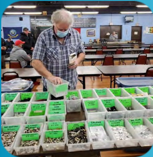
A vendor prepares his wares.