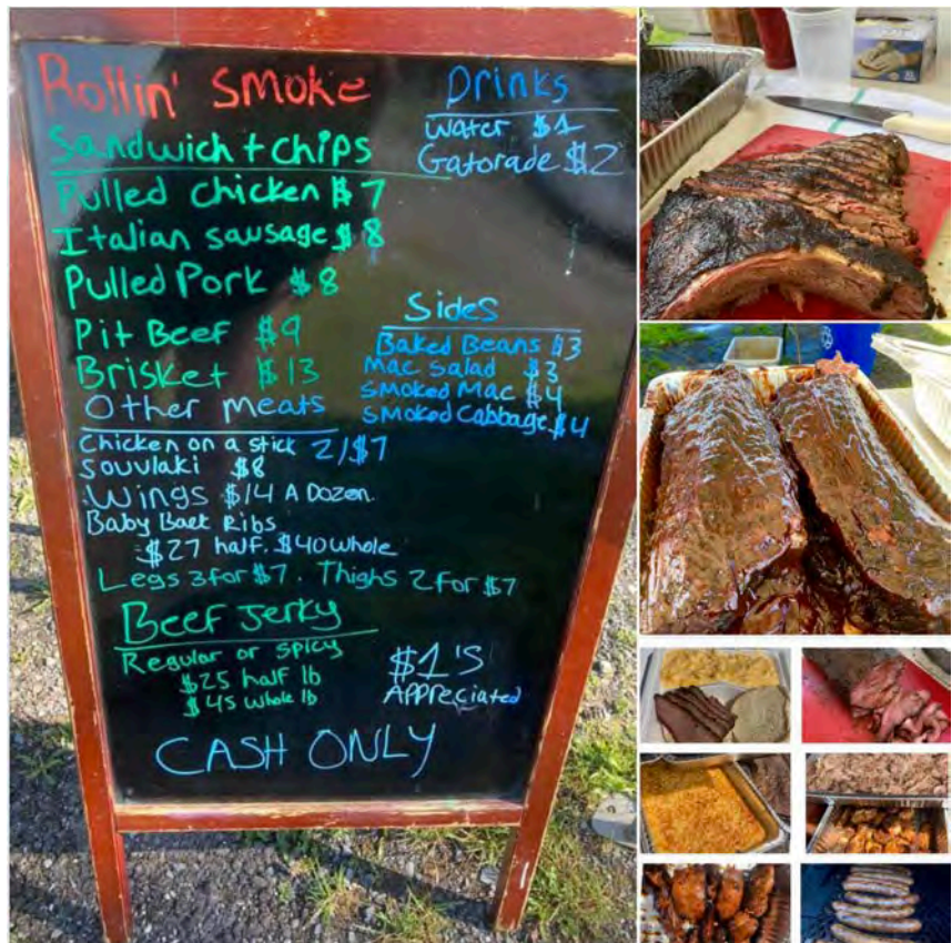
Rollin' Smoke Mobile BBQ & Catering serving at 0630L. (prices and menu subject to change).