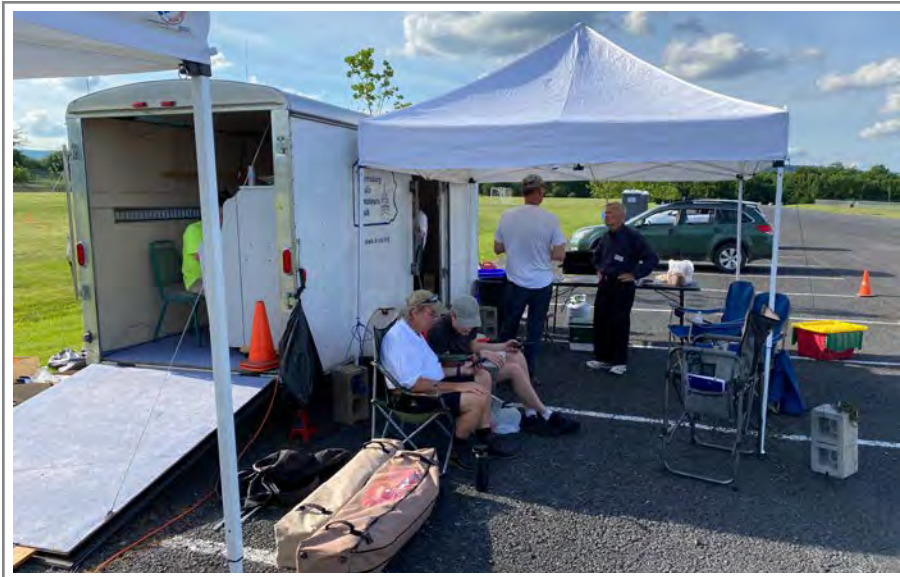
Another Field Day is in the history books. More photos page 8.

HRAC meets the second Wednesday of the each month with “Ham 101” education at 1830L, business meeting, 1900L at the Harrisburg Vietnam Veterans of America Chapter 542 , 8000 Derry St., Harrisburg, PA 17111.