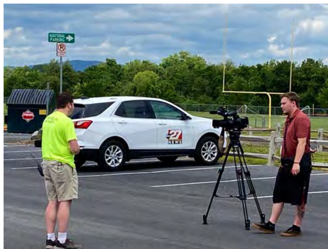
WHTM-TV visited the site. A full story may be viewed at: https://tinyurl.com/cs7cz2tc

More images can be found on the Club's Facebook page.