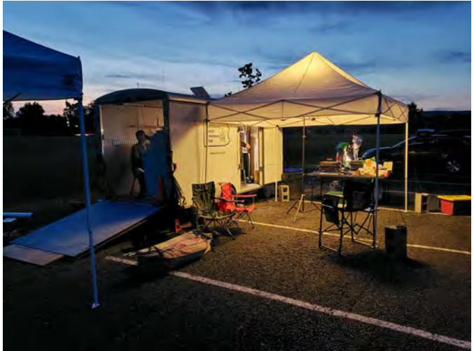
W3UU set up and operating into the night at Adams-Ricci Community Park, Enola.