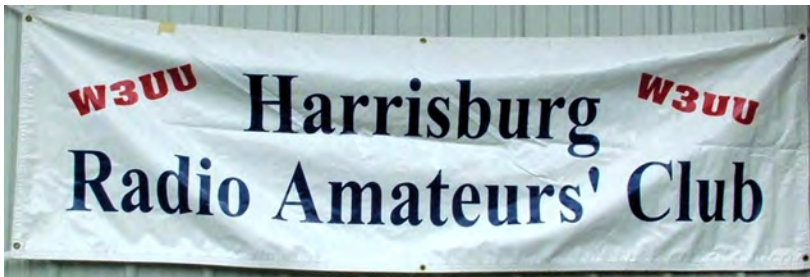
Ahh... those wee hours before...

The July Firecracker and Convention, 3 July, was an immense, overflowing, success! A more full report can be heard at the next meeting of the Club, 11 August.