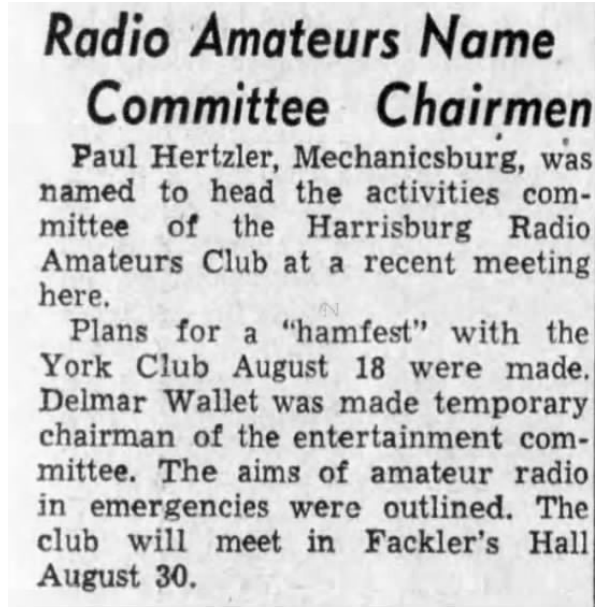
The [Harrisburg, Pennsylvania] Evening News, 29 July 1946, p.11.