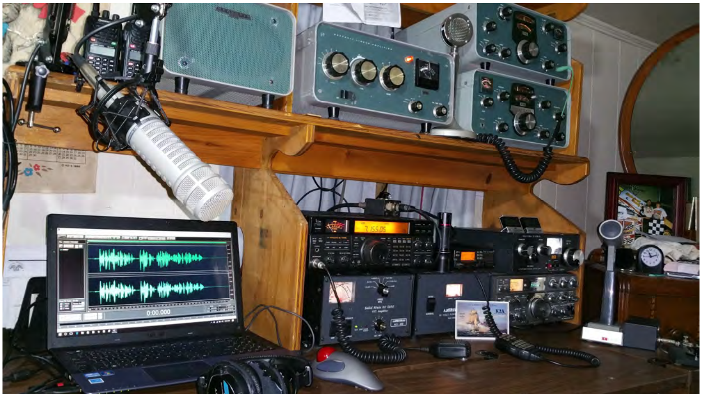
Top: Complete Heathkit station SB-300, SB-400 and SB-200 amp

Show me Yours: No, not the game we played on the playground. What? You didn't play that game?? Well, it isn't that game. It is Show your station. Send your pictures in to me and a few words about it and it will appear in the upcoming issues. Here is my current setup: