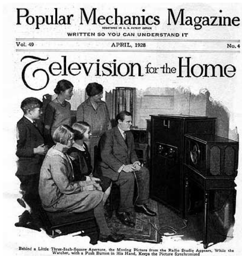
Behind a Little Three-Inch-Square Aperture, the Moving Picture from the Radio Studio Appears, While the Watcher, with a Push Button in His Hand, Keeps the Picture Synchronized