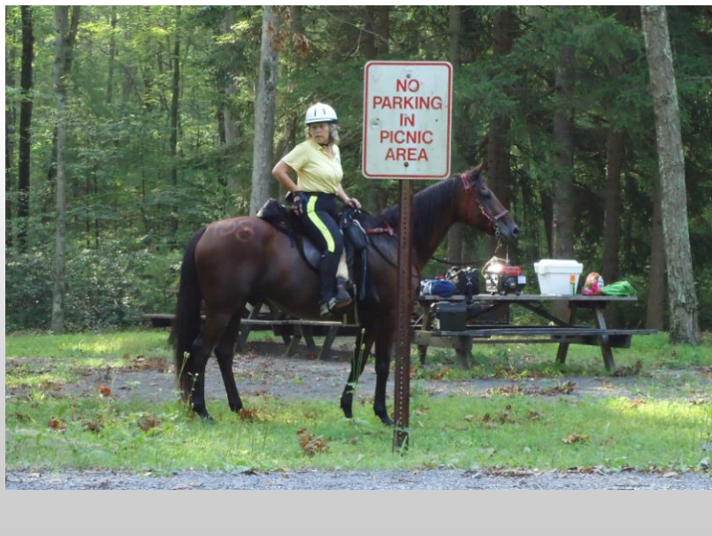
Pictures from previous Muckleratz Trail Ride events we helped with.....